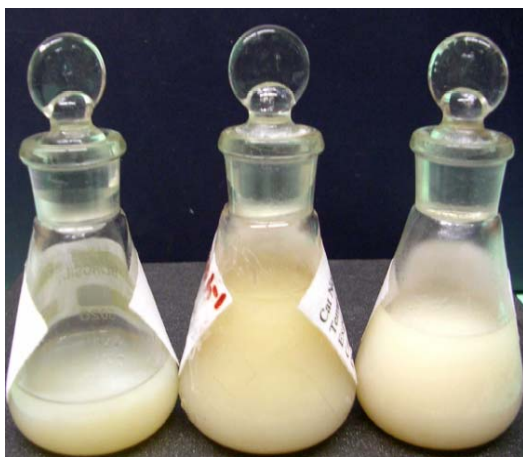
GTL Liquid/wax product